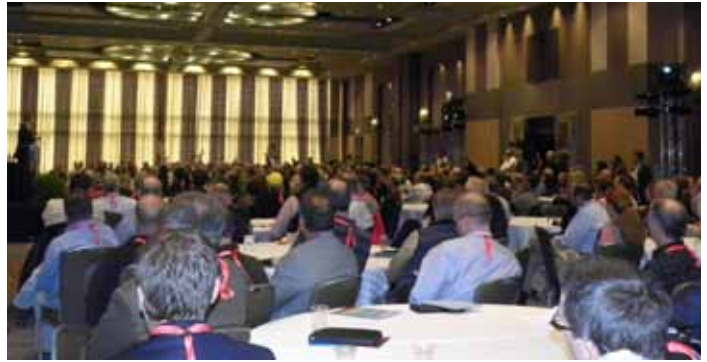
Members gather during the 2011 SIOR Fall World Conference Closing General Session in Chicago

“The big problem we had during our time was the initiation of the Clean Air Act, the environmental act. It was seen as inhibiting industrial development, and we felt very threatened by these new regulations.”