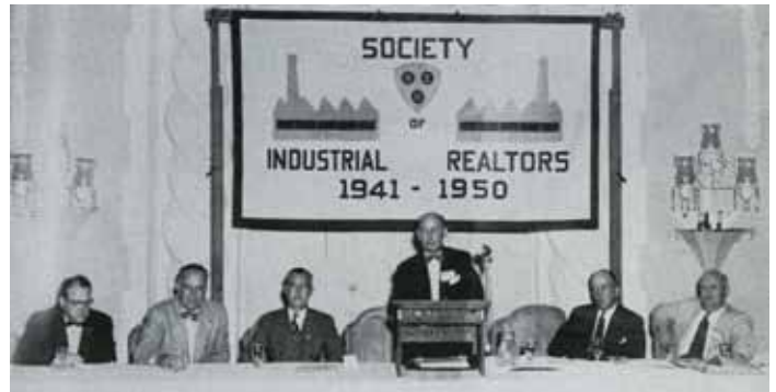
Shown in this picture: SIOR's 1949 Governing Council during a luncheon meeting